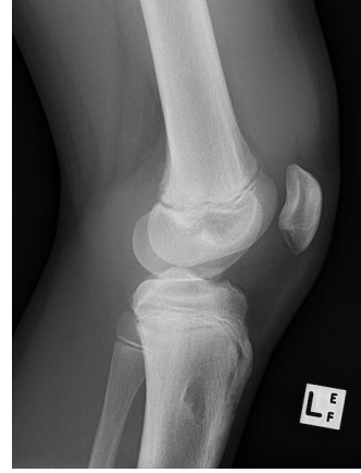
Tibial spine fracture seen on lateral view. Case courtesy of Dr Jeremy Jones, Radiopaedia.org. From the case <u>rID: 27372</u>

In pediatric patients with suspected ACL tear, look for tibial spine fracture on both AP and lateral x-ray which will change management in that these patient require immobilization in extension.