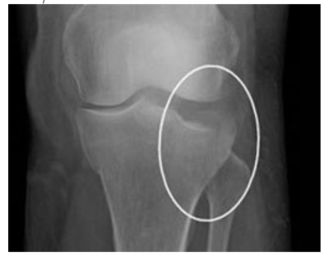
Lateral tibial plateau fracture. Note that the subchondral line is lower on the lateral vs medial side.

Pearl: When assessing for a suspected MCL injury after a valgus force injury and you're applying valgus strain to the knee, if the patient complains of both lateral and medial knee pain, look for a lateral tibial plateau fracture.