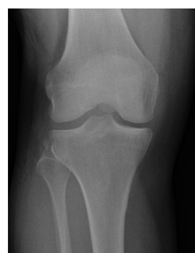
Segond fracture confirms the diagnosis of ACL rupture. Case courtesy of Gerry Gardner , Radiopaedia.org. From the case \underline{rlD} : 13910

In adult patients with suspected ACL tear, look for a Segond fracture at the lateral tibial which will confirm the diagnosis but not change management.